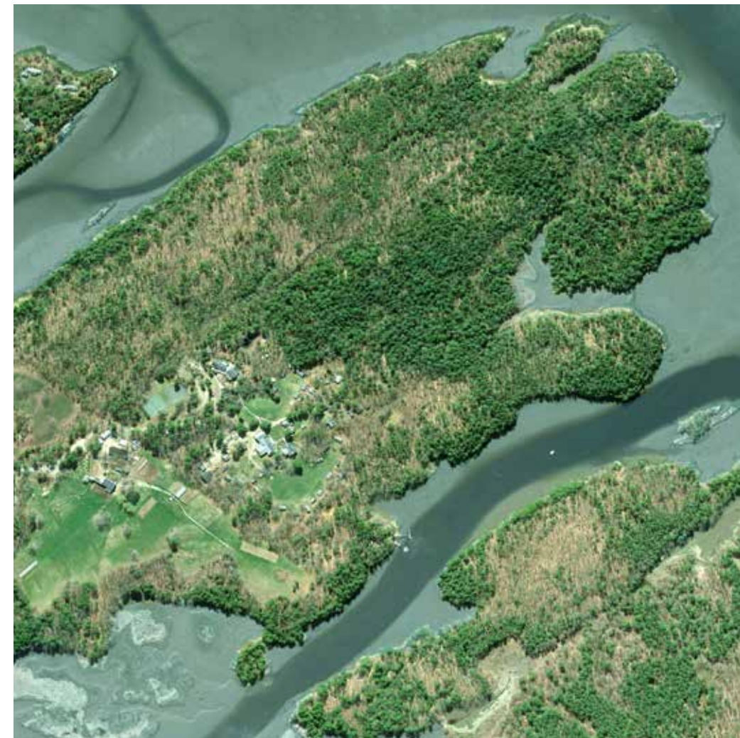
Our 400-acre campus, located on a saltwater peninsula named Chewonki Neck, is also home to our farm, challenge course, and miles of forested trails.

Sustainability—meeting the needs of the present generation while preserving the ability of future generations to meet their needs—is a core part of our mission. You will learn about sustainability and you will live it every day. You'll split wood to heat your cabin, turn compost, and care for the animals that work for and feed you. You'll join thoughtful dialogues about how each of us impacts the natural environment and how we can work toward meaningful change through advocacy and leadership.