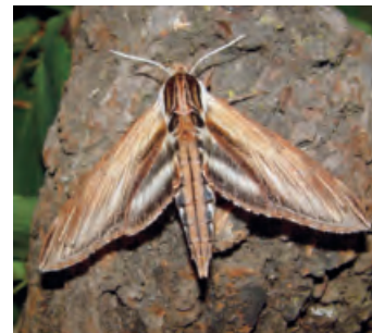
An adult Fawn Sphinx Moth

"Doc Fred" directs the nature program at Chewonki Camp for Boys.