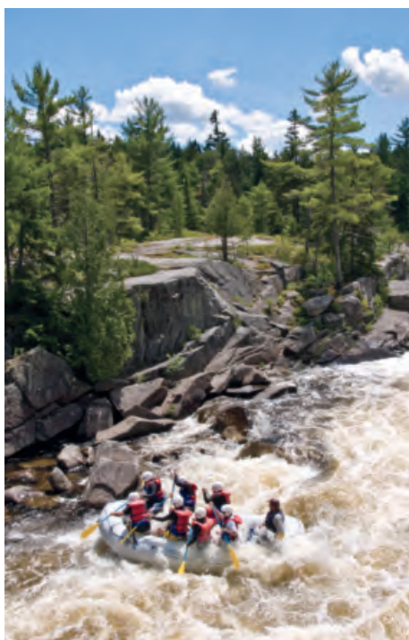
Whitewater enthusiasts continue to enjoy the elevation drop at the Cribworks Rapid on the West Branch.