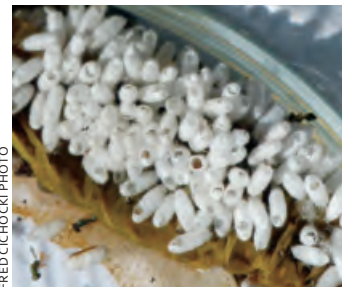
Cotesia cocoons after both species of adult wasps (visible) have eclosed