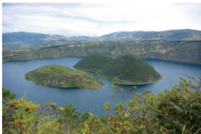
Laguna Cuicocha, a crater lake in the Ecuadorian Andes.