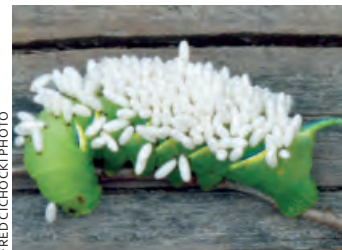
Fawn Sphinx caterpillar covered with fresh Cotesia cocoons. The small dark spots are larval exit holes.