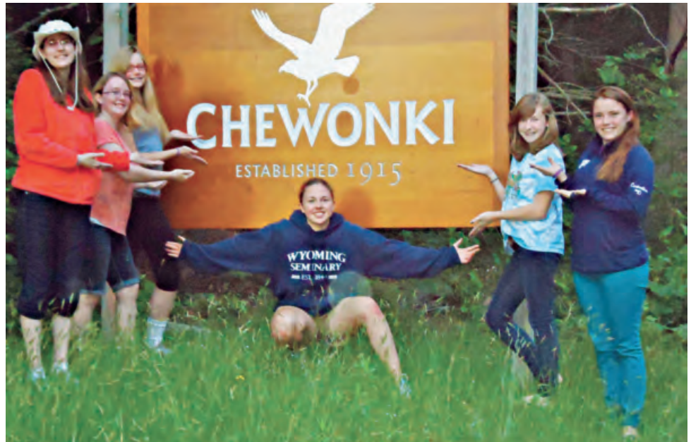
This year's Wyoming Seminary volunteers were all smiles at Chewonki in June.

The goal of the June trip is two-fold, he says. "One is to do good, meaningful work, and the other is to experience Maine. For most of the students, this is their first trip north." In addition to exploring the local area, the trip includes a few bigger excursions as well. This year's group