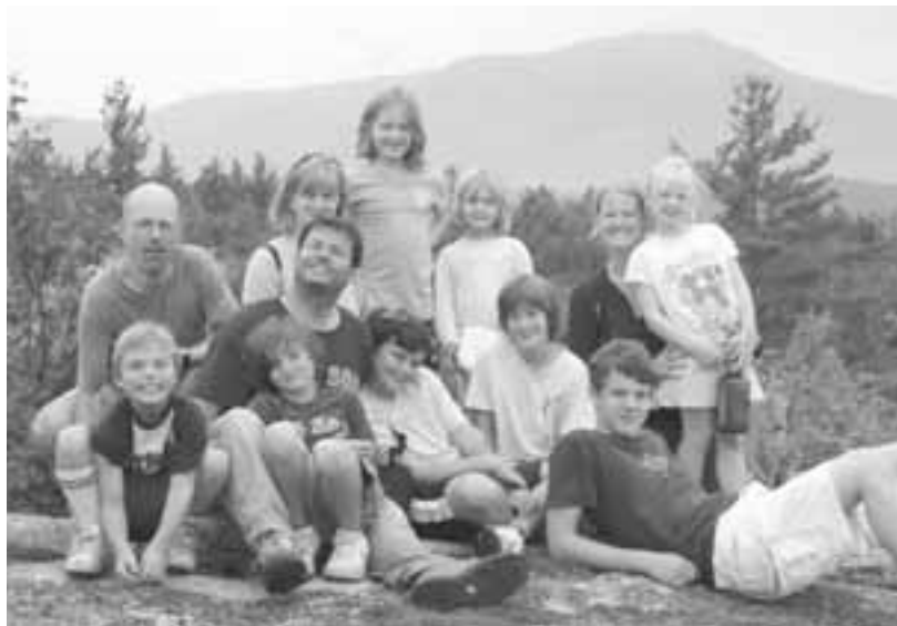
Family Campers 2008, on the cliffs above Fourth Debsconeag Lake.

Asked if Family Camp will be offered again next summer at our newest northern location, Greg, Lynne, and Betta all agreed it will be and quickly volunteered to provide staff support. Dates and fees are posted on our website ( www.chewonki.org/alumni ).