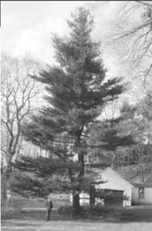
FRANÇOISE C. LITTLE

Eager to know more, we called Jack. One of the first things we learned is that he is just over 6 feet tall. Extrapolating from the photo, it looks like his tree is at least 60 feet tall now.