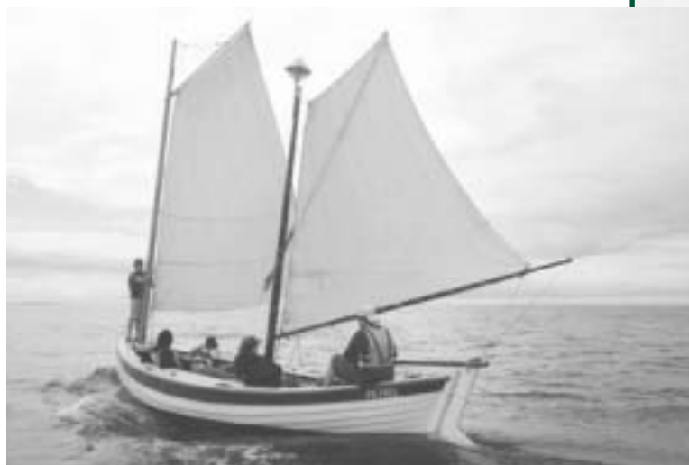
The new islands will provide spectacular camping opportunities for Chewonki trippers in Penobscot and Muscongus Bays. Pictured here is last summer's Osprey Cabin sailing trip in Penobscot Bay.

There will be more to come. Fifty-acre Russ Island off Stonington, heralded by many as one of the natural