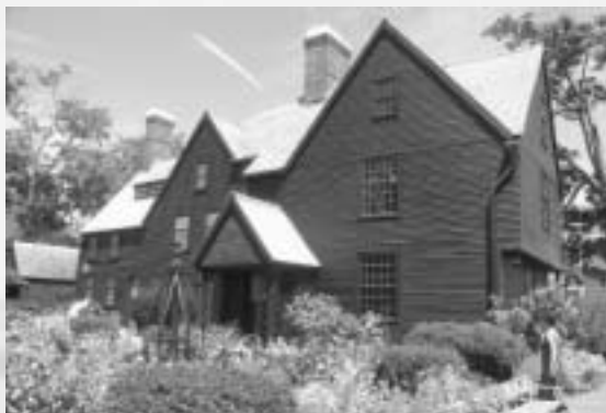
Salem's House of the Seven Gables, which inspired Nathaniel Hawthorne's novel of the same name.

live during the time of Ford's $5 dollar workdays or the great buffalo herds, I have experienced enough to imagine. I can understand what it was like to own a Model T because I rode in one at Dearborn Village, used its only door (on the passenger side; Ford did not want people exiting into traffic), and smelled the oil leaked from its none-too-closely fitted engine.